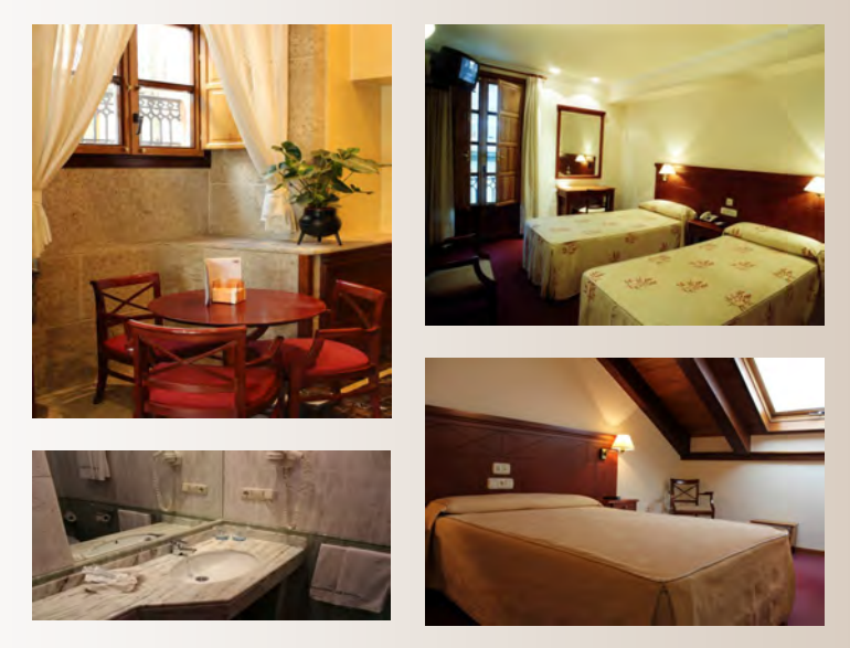
You can book the accommodations in this guide in JUST ONE STEP